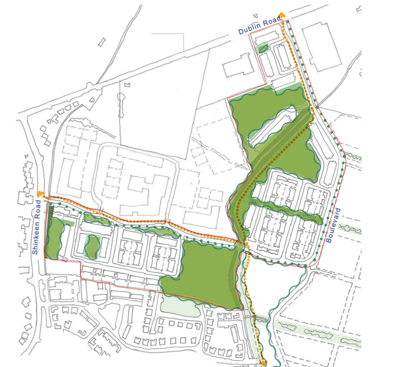
NECKLACE OF OPEN SPACES & ACTIVITIES